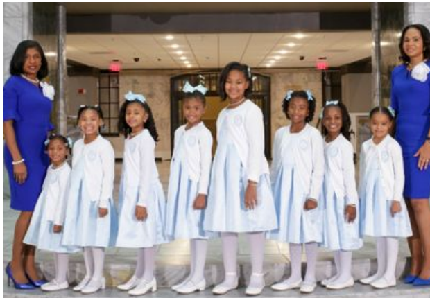
Row 1: Pearlette First Last, Pearlette First Last, Pearlette First Last, Pearlette First Last, Pearlette First Last