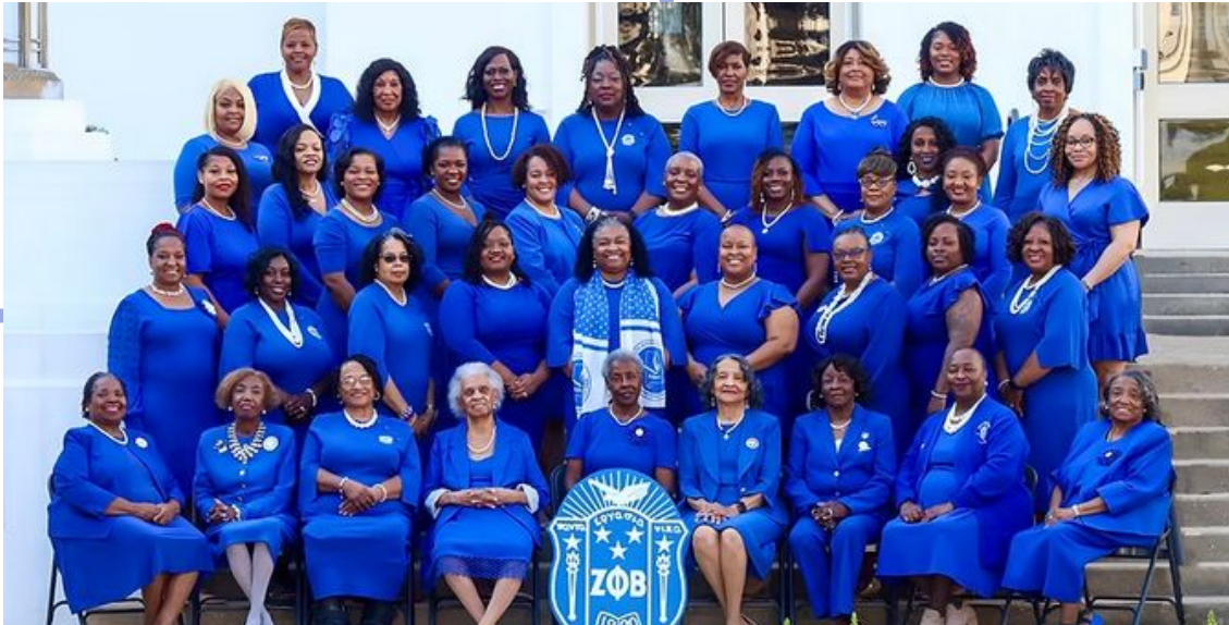
Row 1: Soror First Last, Soror First Last, Soror First Last, Soror First Last, Soror First Last Row 2: Soror First Last. Soror First Last .Soror First Last. Soror First Last. Soror First Last. Soror First Last. Soror First Last Row 3: Soror First Last, Soror First Last, Soror First Last, Soror First Last, Soror First Last Row 4: Soror First Last. Soror First Last .Soror First Last. Soror First Last. Soror First Last. Soror First Last. Soror First Last Row 5: Soror First Last, Soror First Last, Soror First Last, Soror First Last, Soror First Last