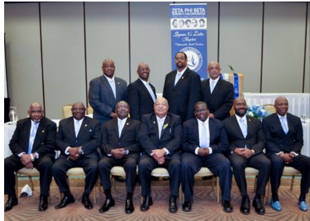
Row 1: Mr. ZMN 1, etc... Row 2: Mr. ZMN, etc...

Comments: Images are uniform Everyone is visible Business/dress attire